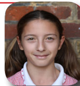
Name: Victoria Ashcroft Technology Academy

Memories: I remember Sayers Croft as every morning we woke up to the Macarena. My favourite activity was the abseiling and I really want to do it again. I liked going to Cadbury World because we got to taste fresh chocolate; it had just came out of the machine!