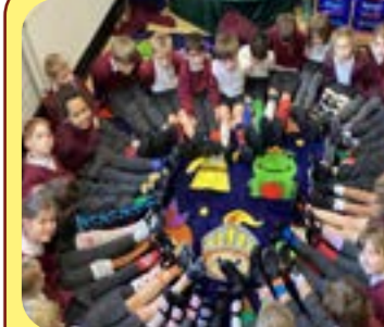
Odd Socks Day For NSPCC