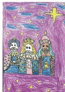
Otilie - Year Five